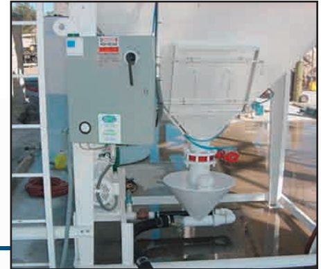
Automatic Recycle System